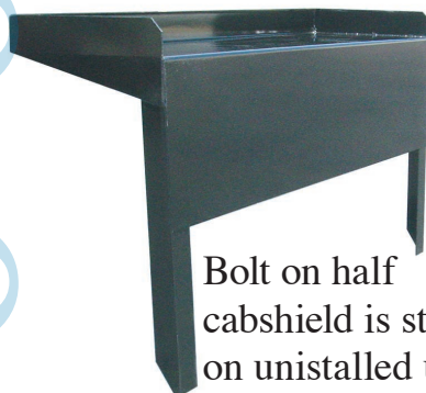
Bolt on half cabshield is standard on uninstalled units

The Godwin 600U/T series body features a weight saving smooth crossmemberless understructure, a shock absorbing rubber cushioned mount, and a durable AR 450 steel floor with 12" radius corners for cleaner dumping. There are enough length, side height and material options to suit your specific needs. A zinc powder coat primer under powder coat topcoat, and half cabshield are standard features.