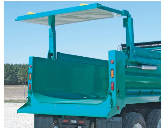
Optional air operated high lift tailgate with other options shown.