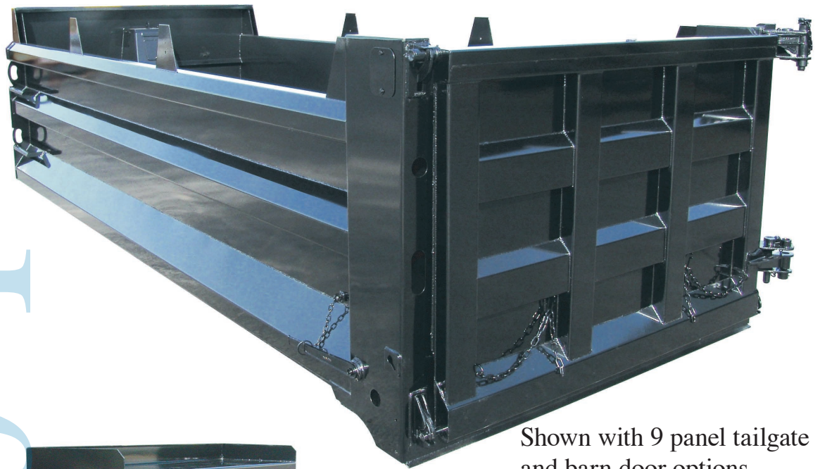
Shown with 9 panel tailgate and barn door options.