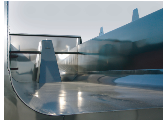
Shown is the inside of the 600U/T body and 12" floor to side radius.