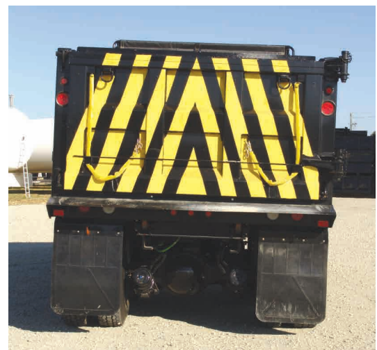
Sitting at 5° to the right before dump

Only a 6" side shift at a 35° dump angle. Truck was side loaded with 12,360 lbs of loose material. The body sat at 5° to the right with 0° dump angle due to side weight. This test was performed on a double frame Sterling with 52000 GVWR. The body was 16 foot long with a 74135 telescopic hoist.