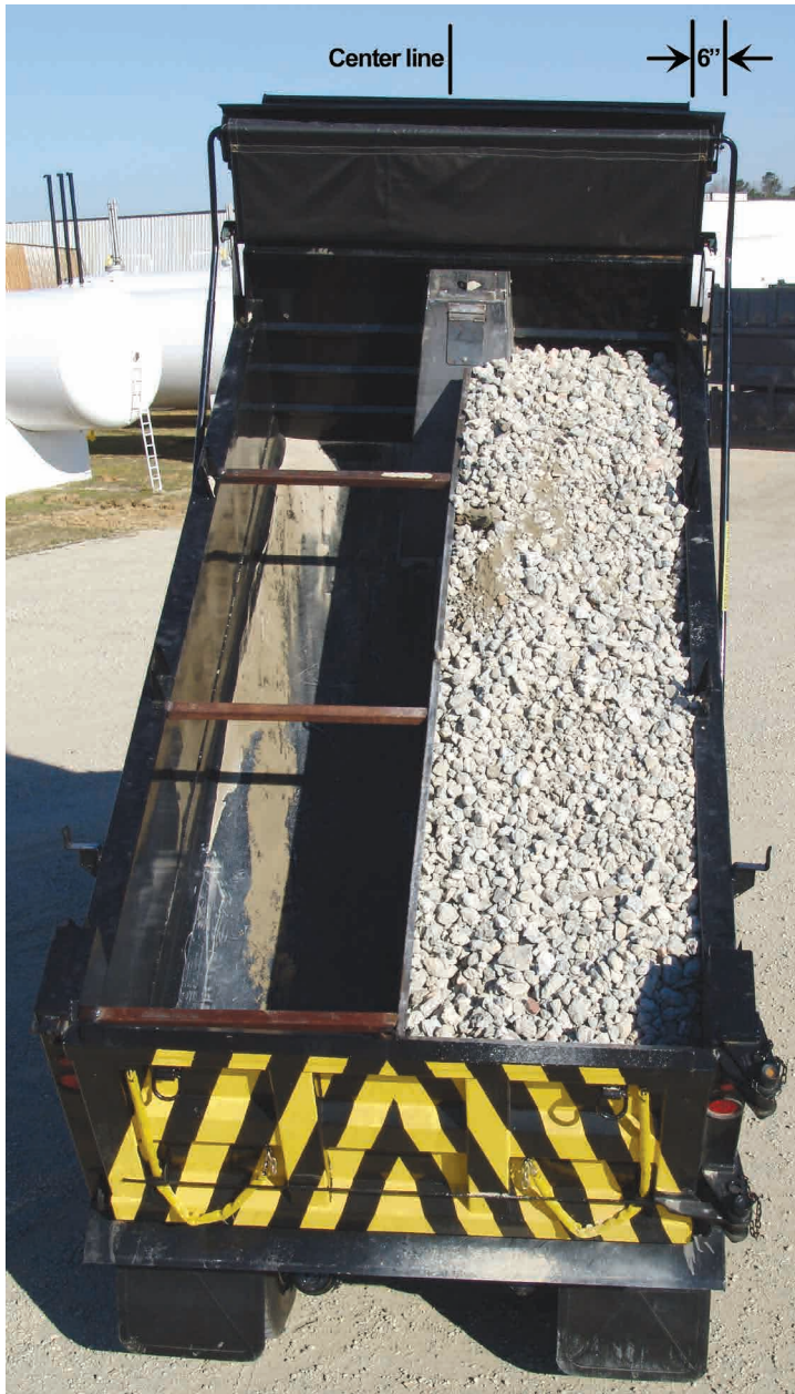
6" side shift during 35° dump.

This cylinder support is designed to fit most telescopic cylinders, including the three major brands and is designed for new and aftermarket applications.